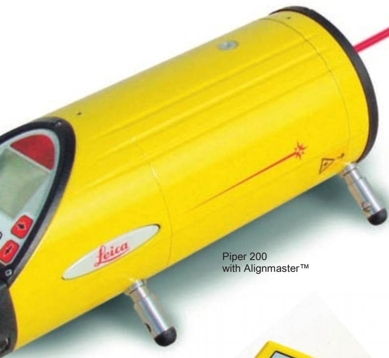
Piper 200 with Alignmaster™

Piper 200 with Alignmaster™ Patented auto matic targeting system searches and finds the target for second day setups.